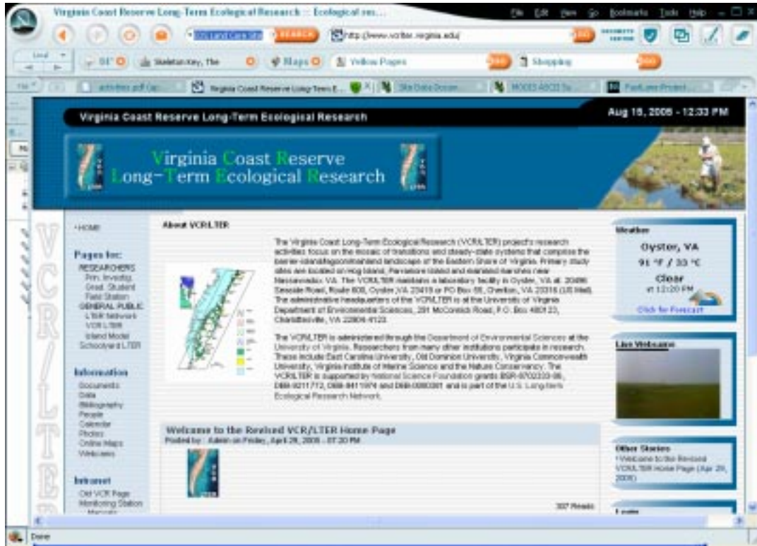
The new VCR/LTER Home Page:

The new web page uses a content management system to facilitate management. In a content management system, page contents are stored in a relational database (MYSQL) and used to populate the pages "on the fly." Our system is a hybrid, with some web pages generated from the database and others in a static form more suitable for archival storage.